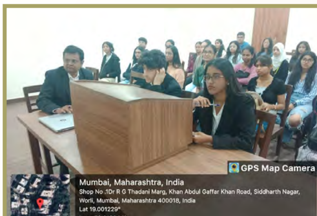
Moot Court Induction and Simulation for first-year students of Academic Year 2023-24