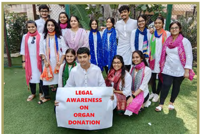
Street Play conducted to create legal awareness on organ donation