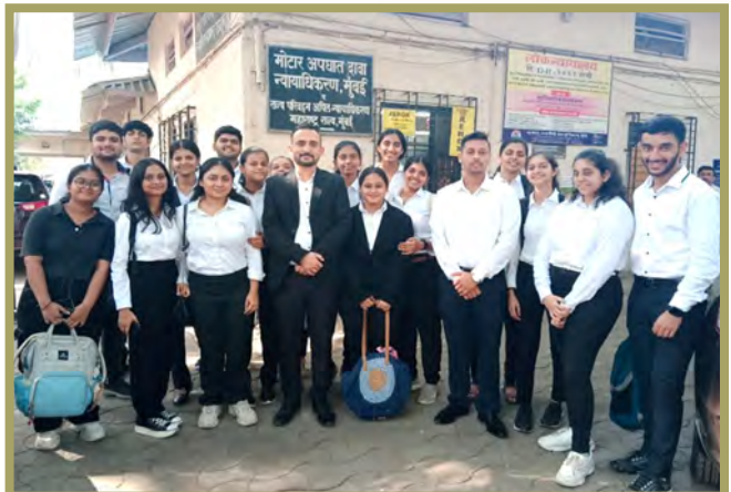
Visit to Motor Accidents Claims Tribunal, February 2023