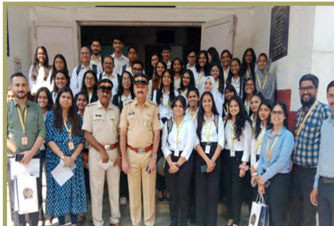
Field Visit to Worli Police Station and Cyber Cell, Mumbai