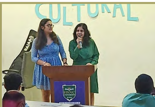
Cultural Carnival and Freshers Party (November 2023)