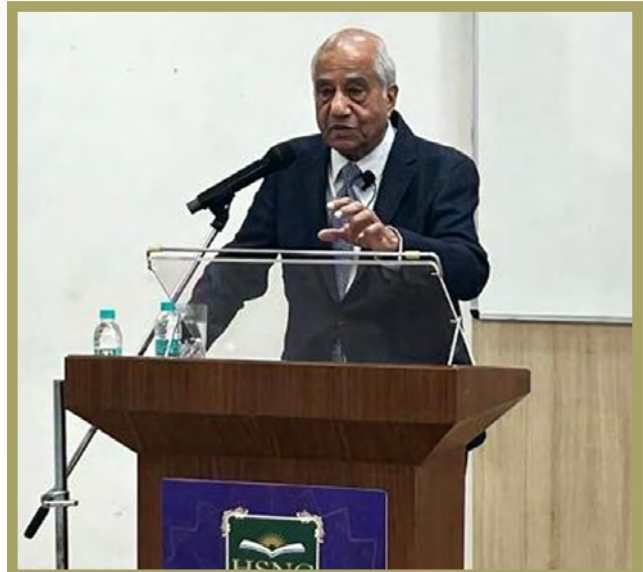
Master Lecture series on "The Right to Privacy under Law" by Hon'ble Justice B.N. Srikrishna, Former Judge, Supreme Court of India