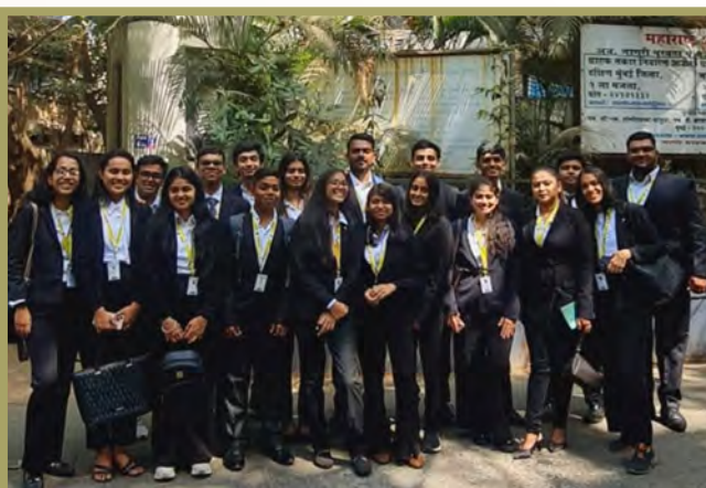
Visit to District Consumer Disputes Redressal Forum, Parel, Mumbai