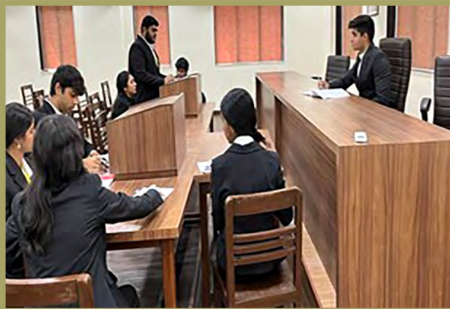
Moot Court Simulation for KC College (Degree) Students