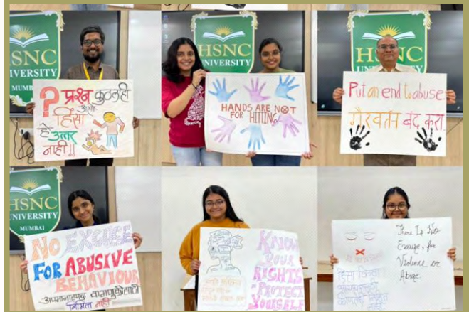
Legal Awareness Rally conducted as part of initiatives of the Legal Aid Cell