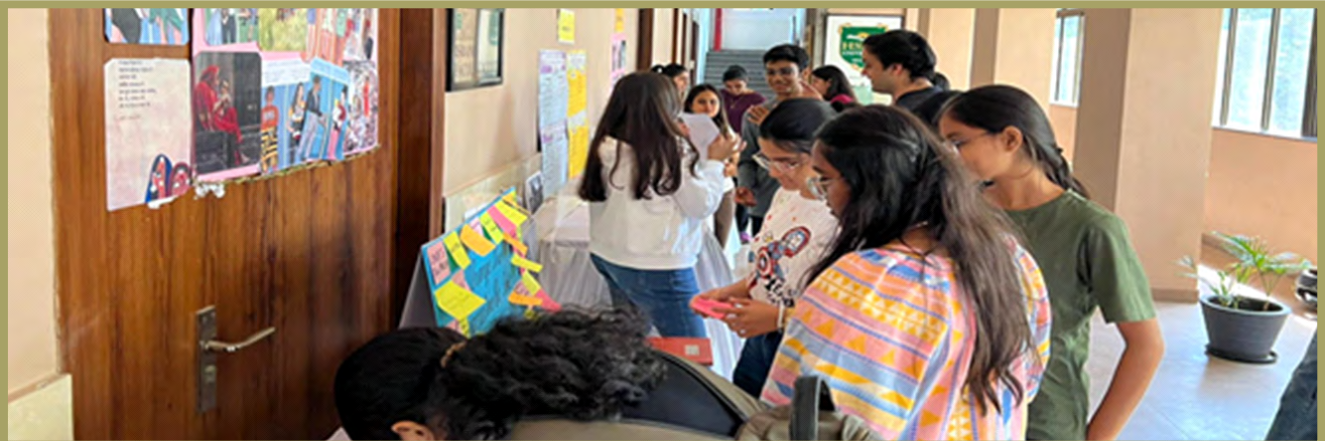
International Women's Day 2024 celebration 'SHE inspires celebration: Honouring Women through Reflective Games'