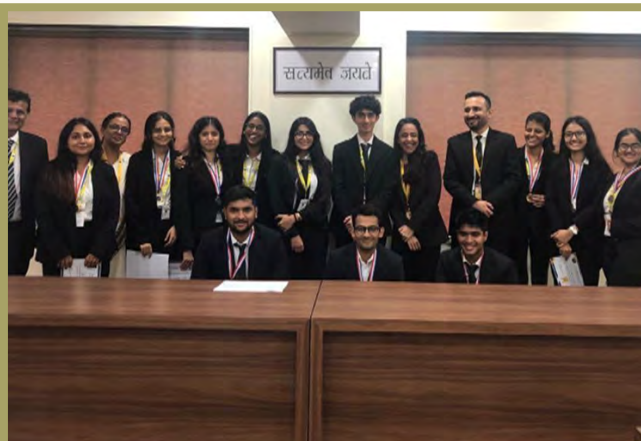
Intra Moot Court Competition 2023