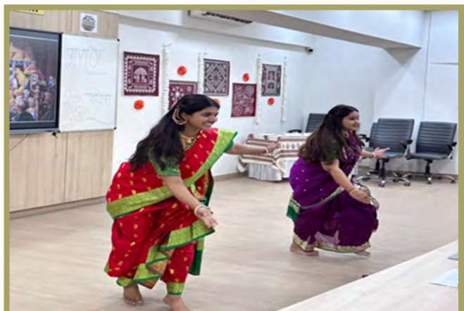
Marathi Bhasha Divas ( Feb 2024)