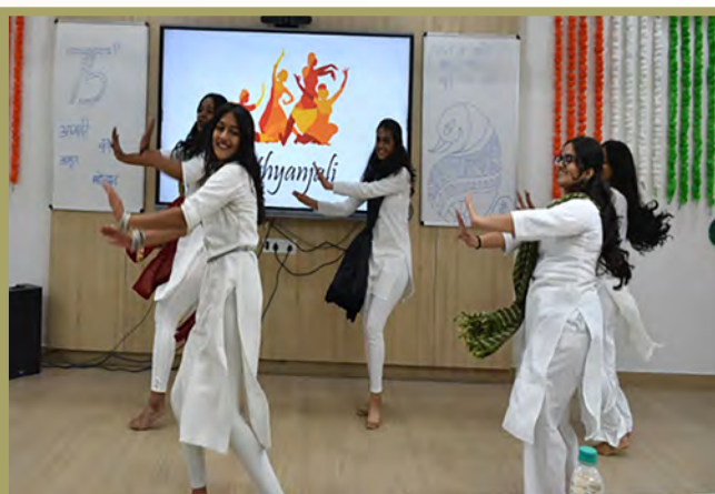
Independence Day 2022 Desh Bhakti Geet Event