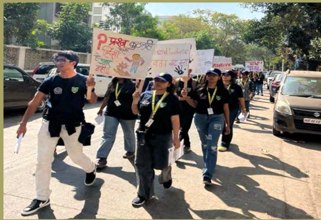
Legal Awareness Rally conducted as part of initiatives of the Legal Aid Cell