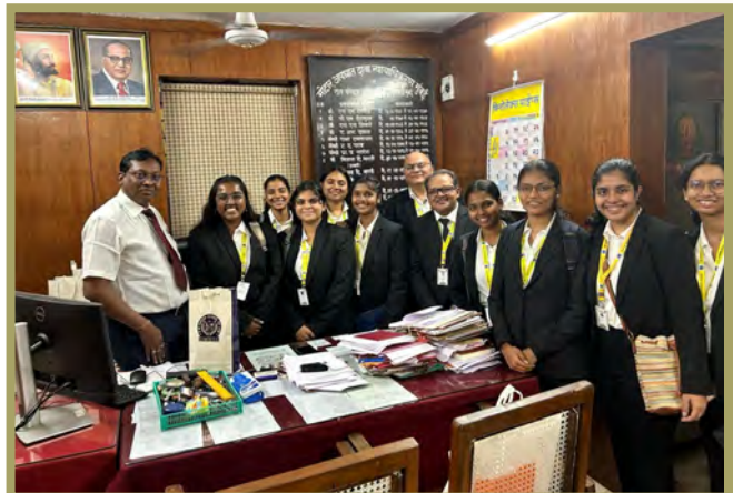
Visit to Motor Accident Claims Tribunal, Fort, Mumbai