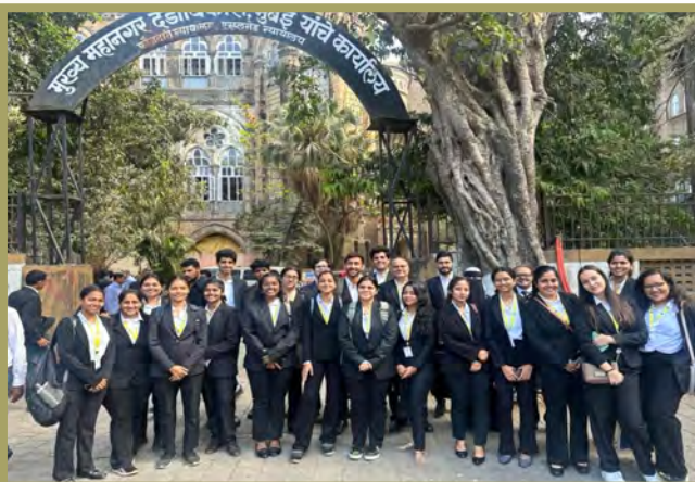
Visit to Esplanade Court (Metropolitan Magistrate Court) Fort, Mumbai