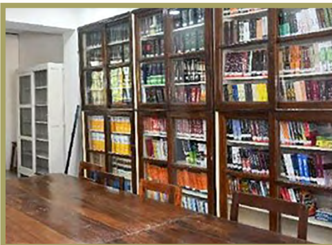
KNOWLEDGE RESOURCE CENTRE