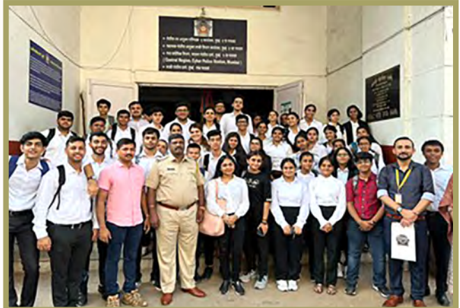
Visit to Worli Police Station and Cyber Cell, February 2023