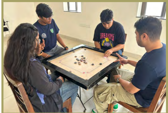
Ultimate Indoor Showdown Event - Chess and Carrom Competitions organised on 28th and 29th February 2024